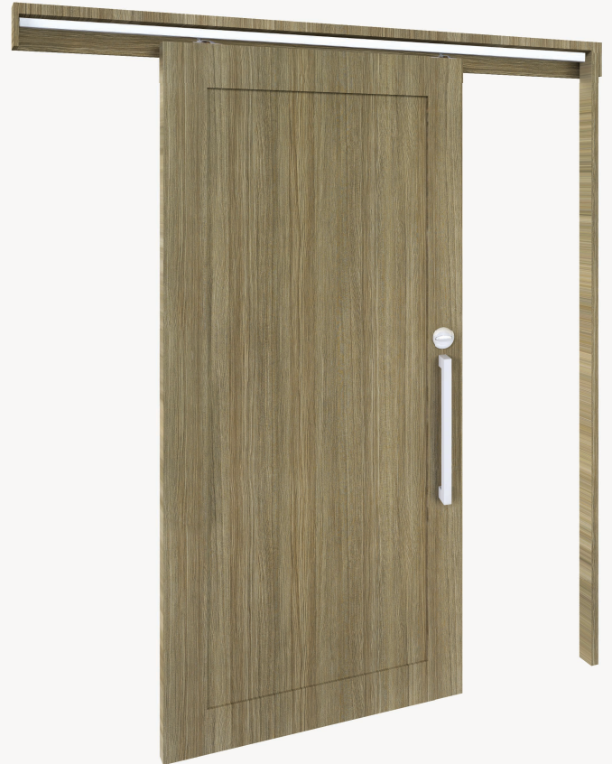
3D View (RH-Inside)