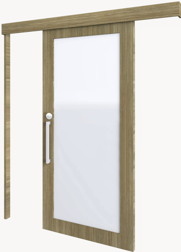
3D View (RH-Outside)